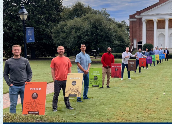
9Marks at Southeastern Seminary.

9Marks wants to provide new and old Christians biblical answers to questions like these, especially questions that focus on our life together in a church. That's been the intent of our Church Questions series. In this series and in everything else 9Marks does, our goal is to nurture healthy church practices and to help Christians live faithfully. And we hope this work continues "until we all attain to the unity of the faith and of the knowledge of the Son of God" (Eph. 4:13).